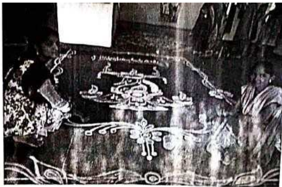
MUGGU(RANGOLI ) COMPETITIONS