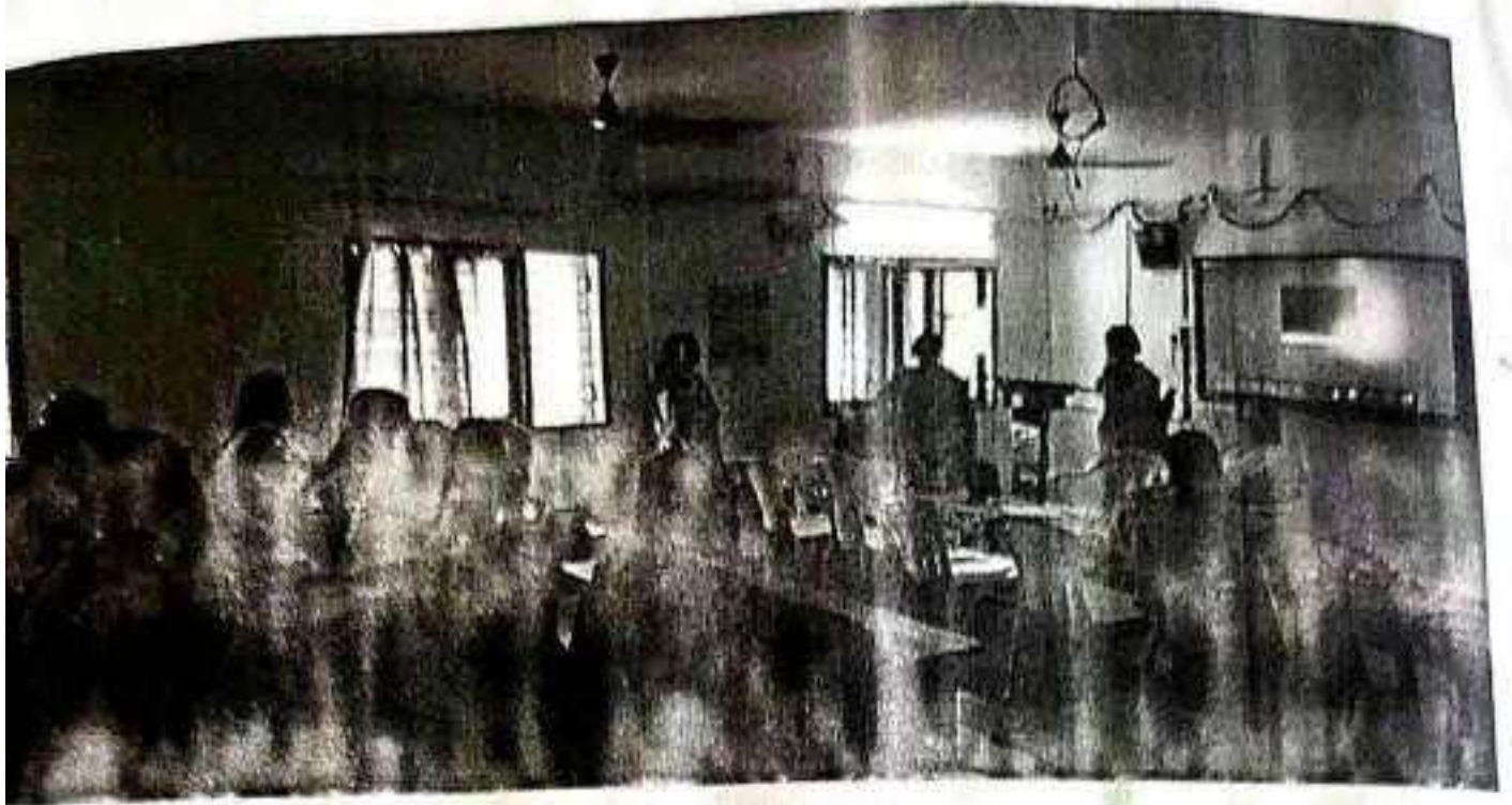
BREAST CANCER AWARENESS PROGRAMME BY WOMEN EMPOWERMENT CELL